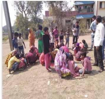
Sports Event for Kids