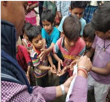
Hand Wash Practice

Rourkela Municipal Corporation in collaboration with voluntary organization CURE have been carrying out various public welfare activities in Rehmat Nagar & Leprosy Colony. Lets' have a look at the Photo Feature Below.