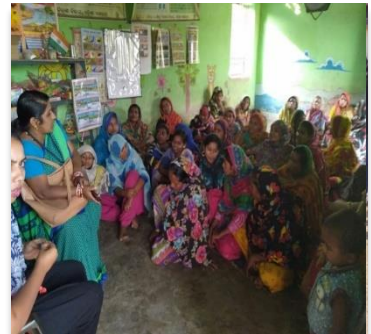
Menstrual Hygiene Training