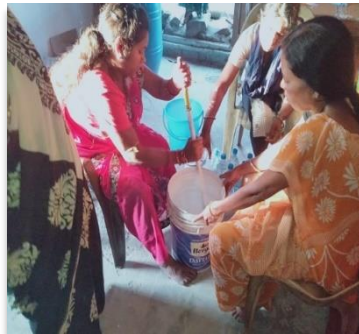
Phenyl Making Training